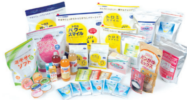
とろみ調整食品・固形化補助食品・やわらか食品・水分補給ゼリー Thickening agents, jellifying agents, soft foods, thickened beverages

嚥下障害のある方や、低栄養の方向けの商品など、特徴のある食品でも「おいしさ」にこだわり、商品を召し上がるお客さまはもちろん、ご家族や商品を提供する方など、全ての方に安心・満足していただける商品を目指し、衛生・品質管理にも徹底的に取り組んでいます。商品は販売代理店を通じて全国へ販売しています。