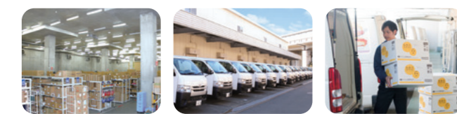
柏物流センター Kashiwa logistics center | 日野倉庫 Hino warehouse | 配送風景 Scene of delivery