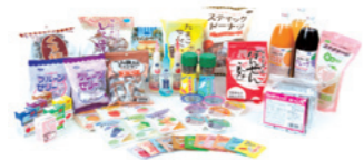
エネルギー・たんぱく質・カルシウム・鉄・亜鉛補給食品等 Nutrient fortified foods