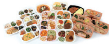
たんぱく質調整食品・エネルギー調整食品 Low-protein foods, low-calorie foods