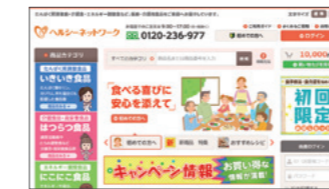
オンラインショップ Online Store