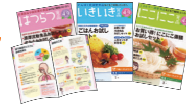
通信販売カタログ Mail-order catalog